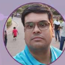
Dr Siddhartha Mukherjee